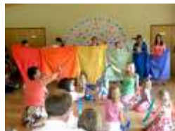
Colourful Rainbow Dance