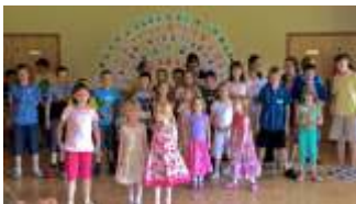
Genesis 9 v 15-19 All together now...

Noahs' Ark: 450 ft long (135 m) 75 ft wide (22.5 m) 45 ft high (13.5 m) wow, that's BIG!